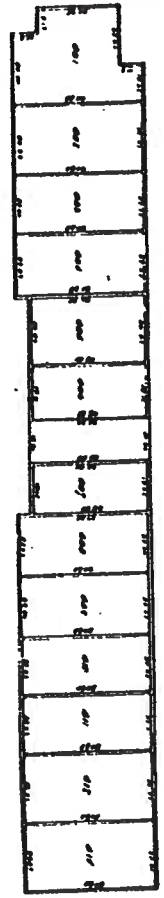
FOURTH FLOOR SCALE 1/8" = 1'-0"