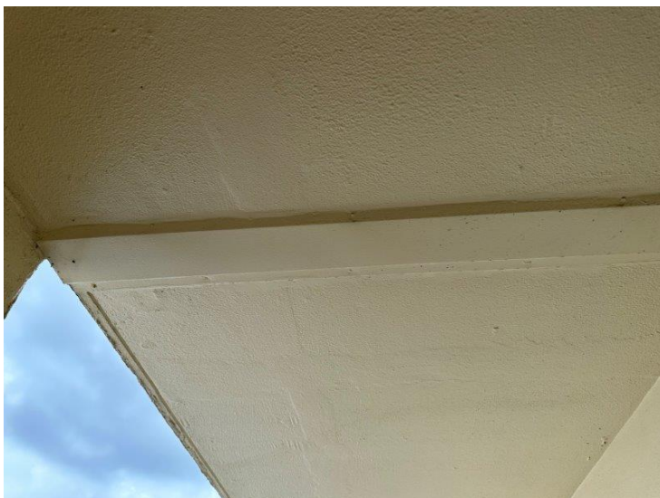
Roof Permit Information Roof Construction